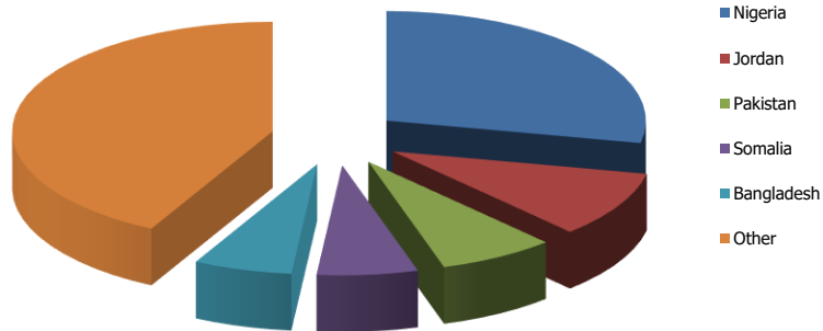
Applications in 2024 (30/06)